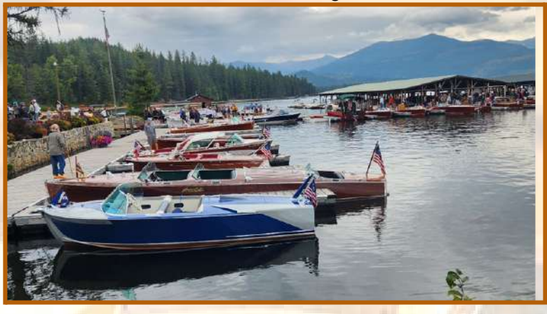
Figure 5 Hill's Resort