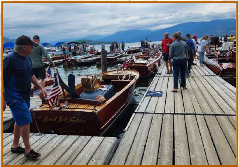
Monday – Rained overnight and the day didn't look too promising but Means to Ski pressed on to the upper