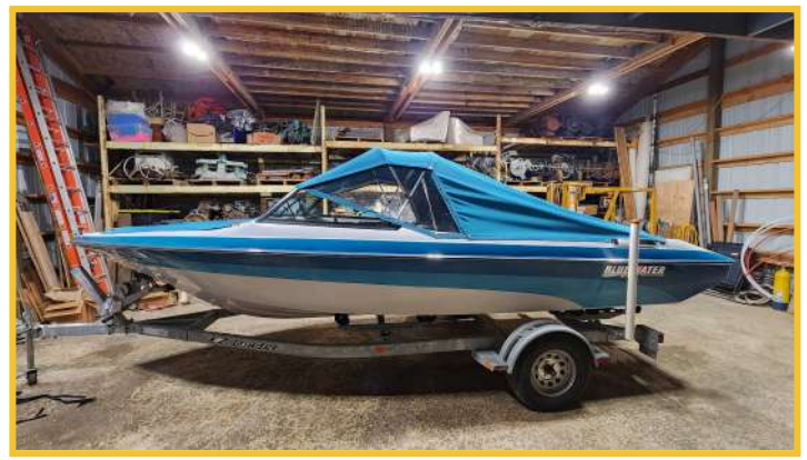
(The Kids' '94 Blue Water "Ka - Bluey" put to bed for the season)

As we embrace the rhythms of the cooler days and tuck our boats away for the winter, neatly drained, dried, and winterized, it becomes time to prepare anew for the next busy boating season. Some of us have exciting new projects, while others enjoy a rest from the comings and goings of a busy travel season.