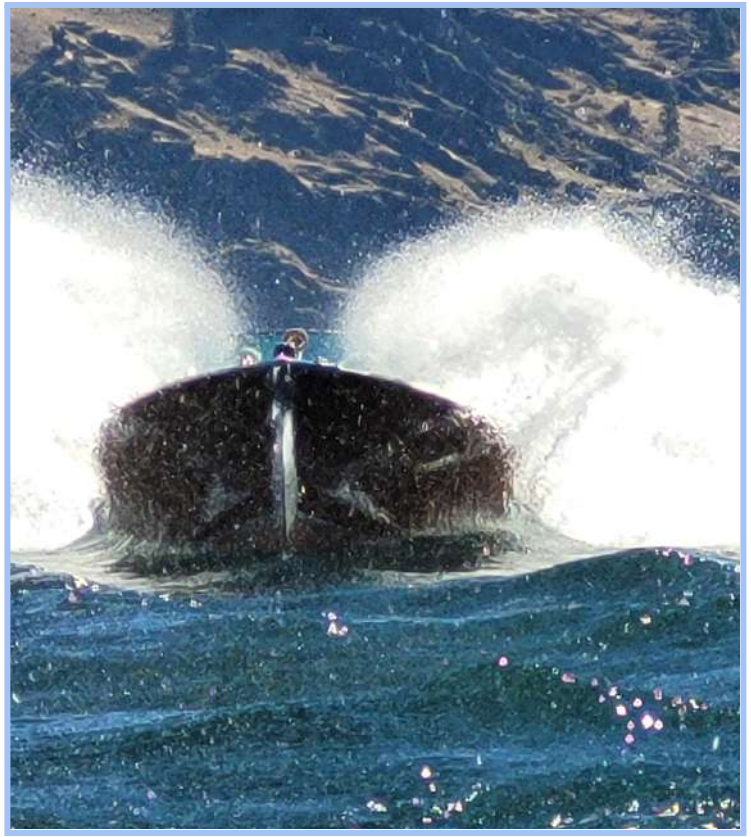
more minutes of getting thrashed. After a particularly large wave crashed and drenched us, I stood up and hollered, "I am done." Greg, got the message and turned Around.

Beautiful Day was the first to turn around and head for shelter. The two remaining boats endured about five