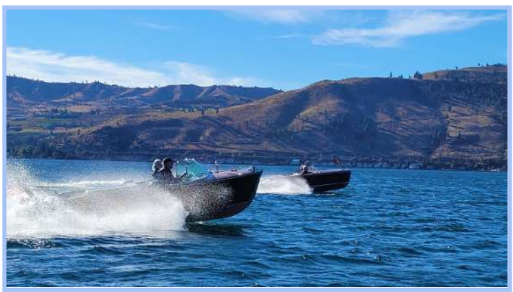
significant waves and 29 knot gusts were looming. Lake Chelan was in a mood and

The real fun began when the ripples turned into a light chop with some white caps. The crashing and splashing had not yet commenced but bigger white caps,