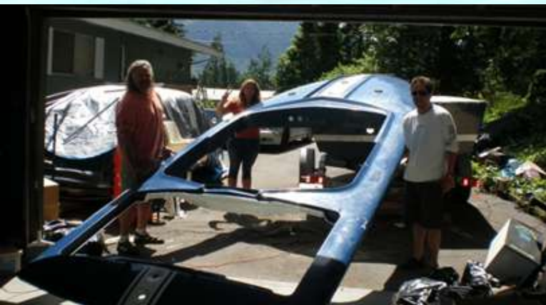
Popping the deck to do proper repairs and reinforcement