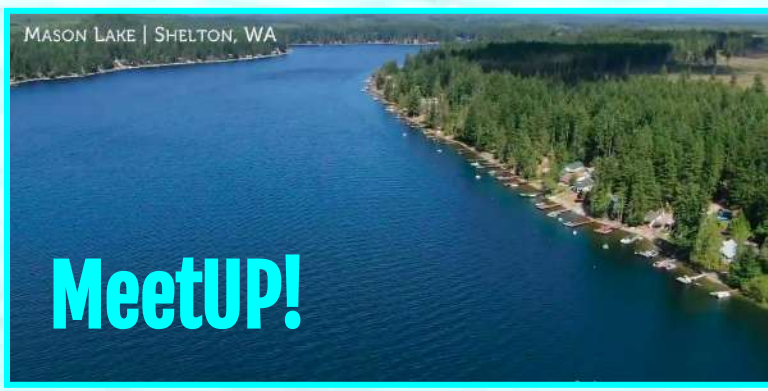
September 2nd, or 3rd. Mason Lake MeetUP! Details will follow...