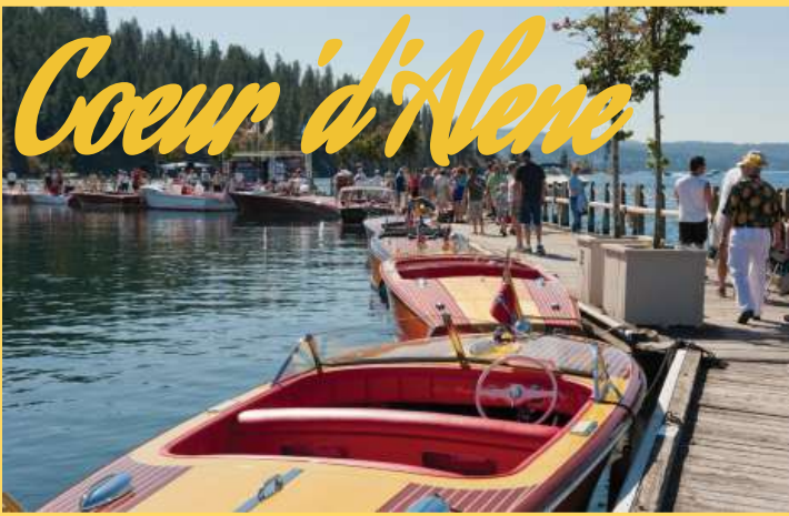
August 11, 10:00 AM – Aug 13, 10:00 AM Beautiful resort setting plays host to the annual Coeur d' Alene Antique & Classic Boat Festival Register here: Inland Empire ACBS