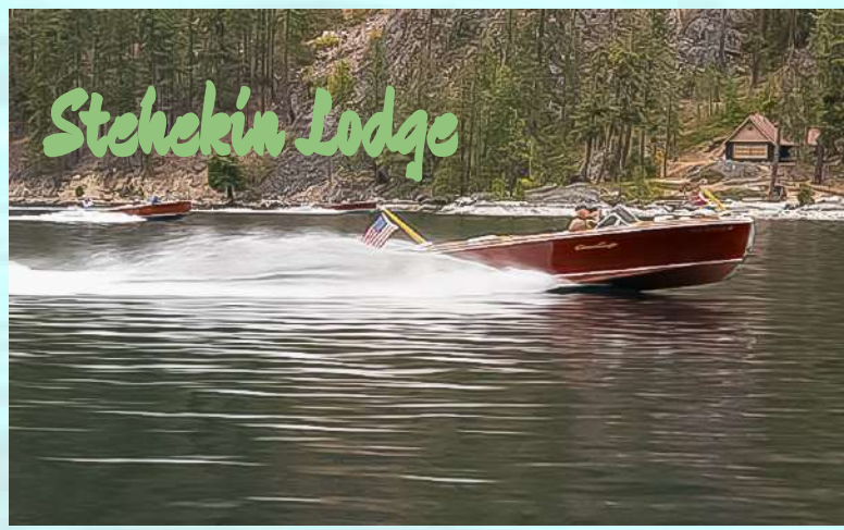
October 4-6 Stehekin pre-event A fifty-five mile run up Lake Chelan is rewarded with good company, a beautiful setting, and peaceful hikes to amazing eateries. https://www.acbs-pnw.org/Registration-Forms