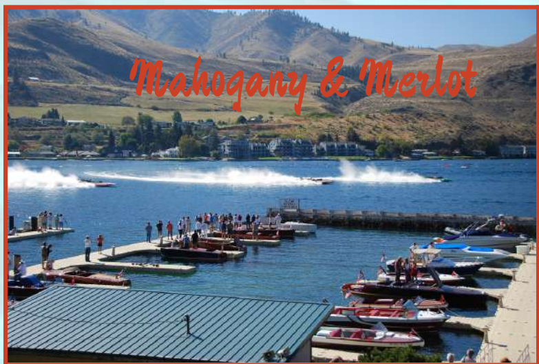
October 6-8 Lake Chelan Join the thunderboats on beautiful Lake Chelan. Enjoy the wineries, the shops in town, and gathering together with our own PNW ACBS beauties! We are often joined by CWC and Inland Empire folks. It's a great opportunity to wind down the season in style. Register Here