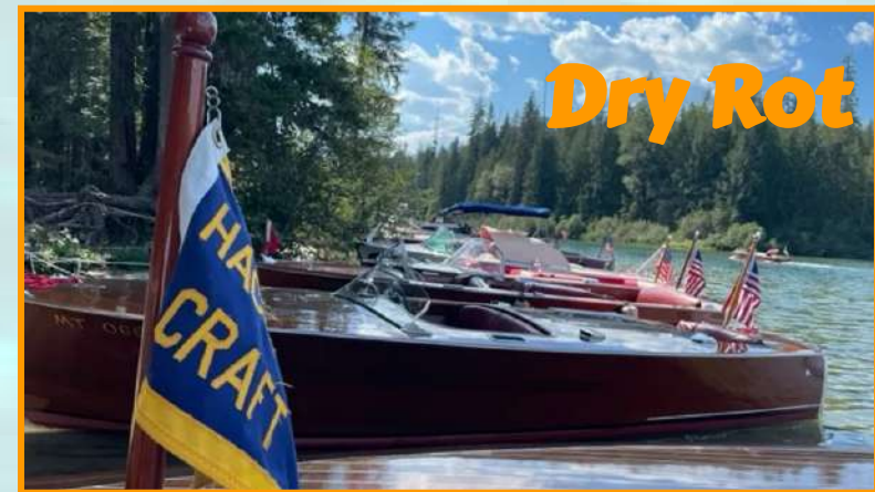
September 1-4 Priest Lake "Dry Rot Boat Show" Register Here The name of this show makes one cringe, but a well organized event is always enjoyed.