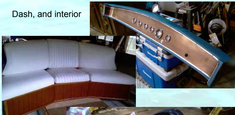
Dash, and interior